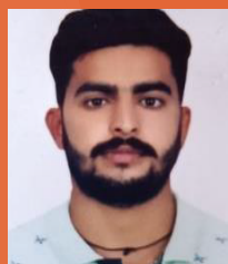
AASHUTOSH NETSTERZ INFOTECH